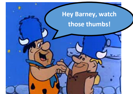
Loyal Order of Water Buffaloes Lodge #26